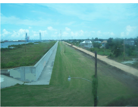
The levee, now repaired, breached by Katrina