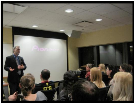
Northwestern hosts Death Penalty Awareness event